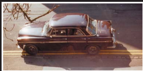
Going, going, gone. Immaculately restored Rover P5B heads off to fund more outboard

For some reason when I presented the business funding requirements, what I was apparently saying was 'Of course, I've put this figure here in accordance with the equipment manufacturers' prices and what I need to borrow to buy this gear; but I just need you