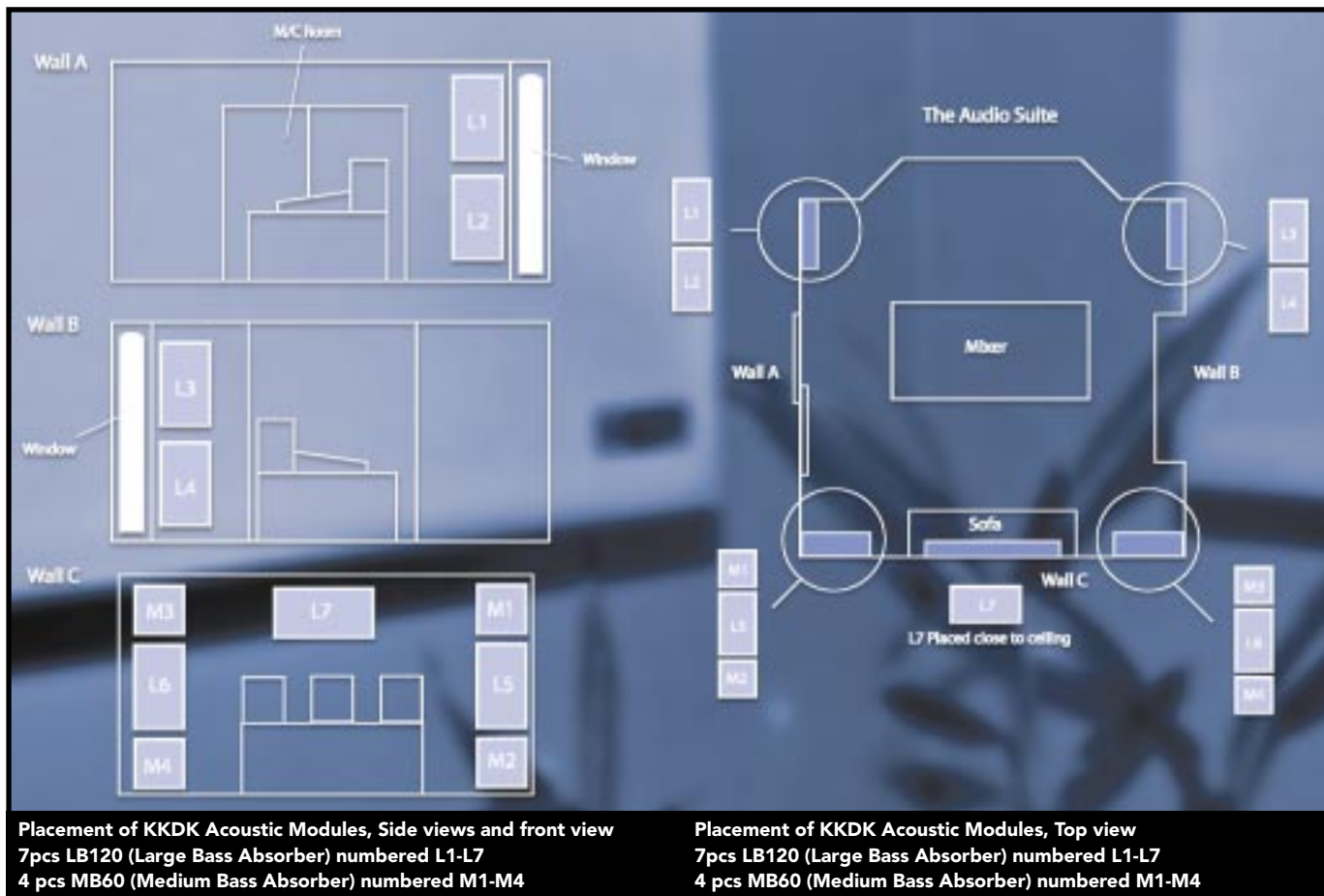
Placement of KKDK Acoustic Modules, Side views and front view 7pcs LB120 (Large Bass Absorber) numbered L1-L7 4 pcs MB60 (Medium Bass Absorber) numbered M1-M4

A pink-noise source needs to be played back from an amplified