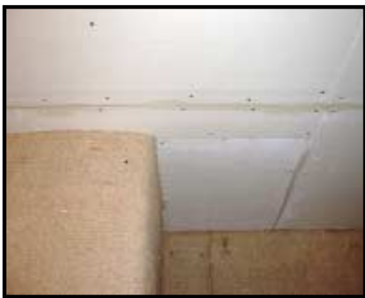
Felt and silicone ceiling.

So the floor was constructed first, then the ceiling, and then the frame for the walls was wedged in between the two giving it a firm fixing but keeping it mechanically isolated from the outside world. Of course, a sound barrier is only as good as its weakest point, so there's no point in building massive, dense boundaries if you're going to leave dozens of tiny gaps at the