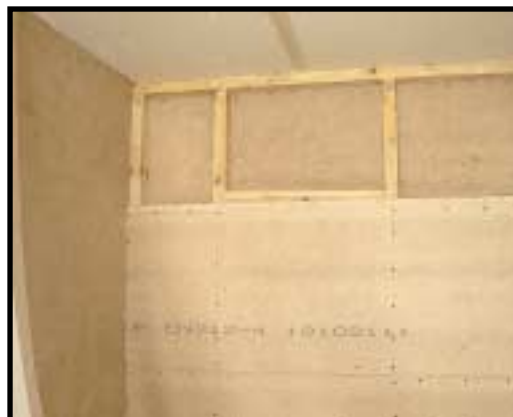
Underfelt, 3 x 2 plus T&G.