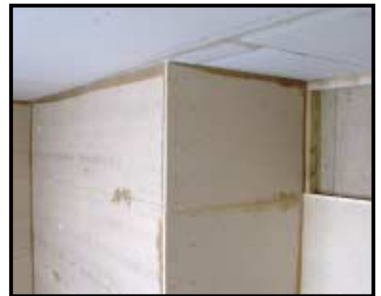
Open wall and silenced ceiling.

To this frame we screwed and glued a layer of tongue and groove plus one of plasterboard. A floating ceiling was built from a layer of T&G and plasterboard but, rather than lose ceiling height with studs, we opted for the use of resilient bar fixed directly through