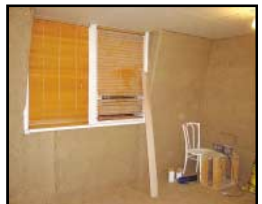
Underlay on wall.