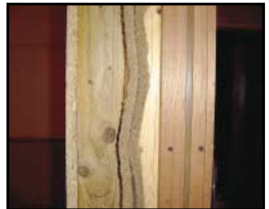
Wall layers in doorway.