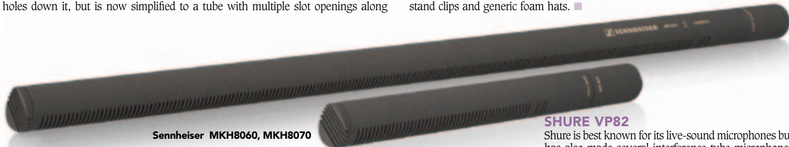
Sennheiser MKH8060, MKH8070

Since interference tube microphones are used in awkward locations, and are frequently waved on poles or fitted to wobbling video cameras, they need protection from wind and handling noise to function successfully. Indeed they can be virtually worthless unless proper provision is made. Many manufacturers are aware of this and now include, or at least offer, bespoke accessories beyond simple stand clips and generic foam hats. ■